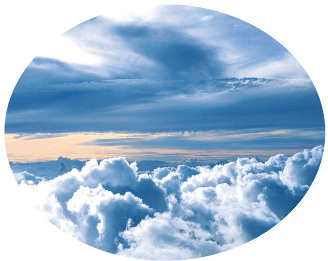
Distribution of Earth's Water