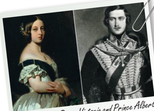
Queen Victoria and Prince Albert

Victoria died in 1901 after having set the example of a hard-working monarchy and head of state above party politics.