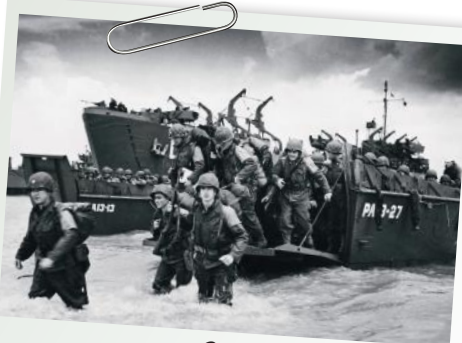
D-day, landing in Normandy

The USA entered the conflict in 1941 after the Japanese attack on Pearl Harbor's naval base. At the Conference of Casablanca in 1943, Roosevelt, Churchill and De Gaulle decided to force Germany to surrender. The Normandy Invasion began on D-Day , June 6 th 1944 with general Eisenhower, who liberated Paris on August 25 th . In 1945 the concentrations camps were liberated with the help of the Russian Army Japan surrendered after the launch of the atomic bombs on Hiroshima and Nagasaki, and Germany soon after.