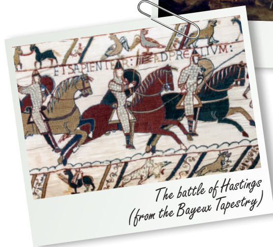
The battle of Hastings (from the Bayeux Tapestry)