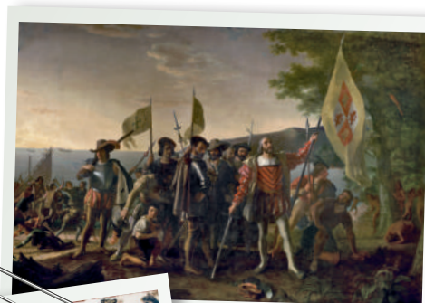
The landing of Columbus (J. Vanderlyn, 1846)

In 1521 his party was fiercely attacked by Native Americans, and he was severely wounded by an arrow. The expedition sailed immediately for Cuba, where Ponce de León soon died.