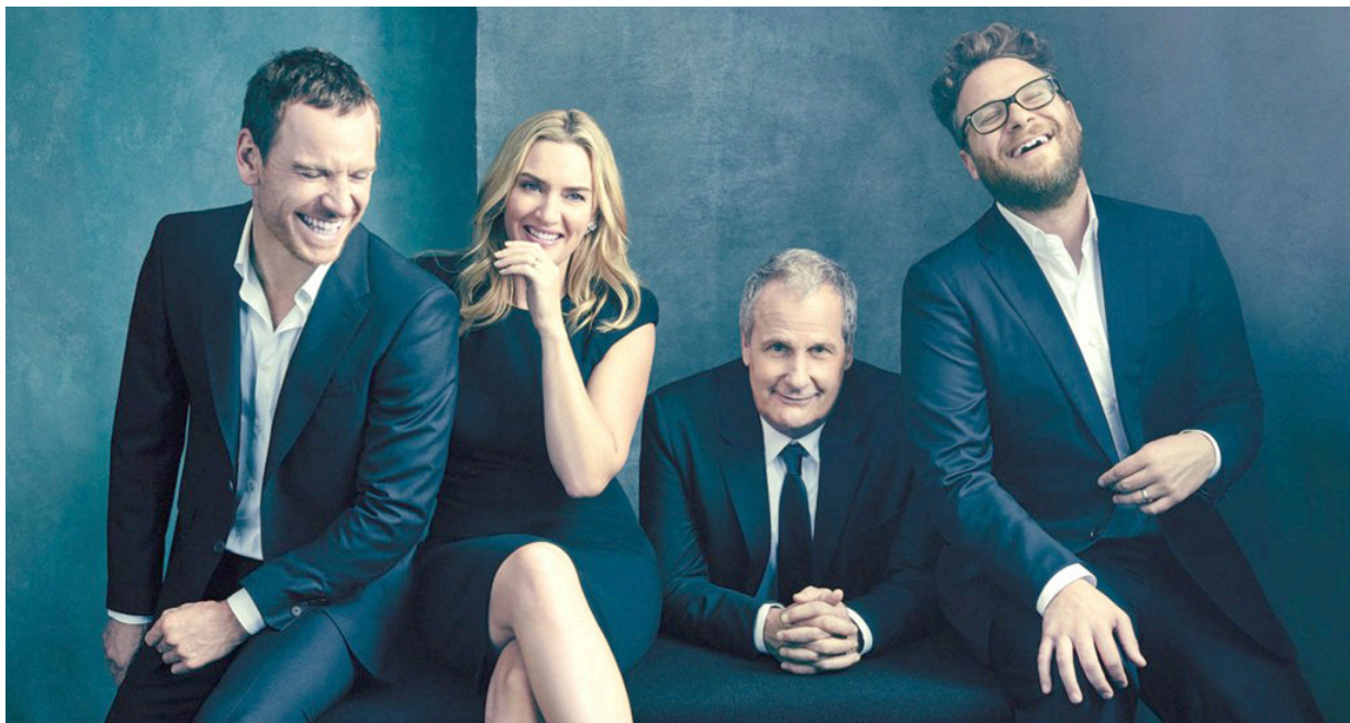
Film cast (from left to right): Fassbender, Winslet, Daniels and Rogen.