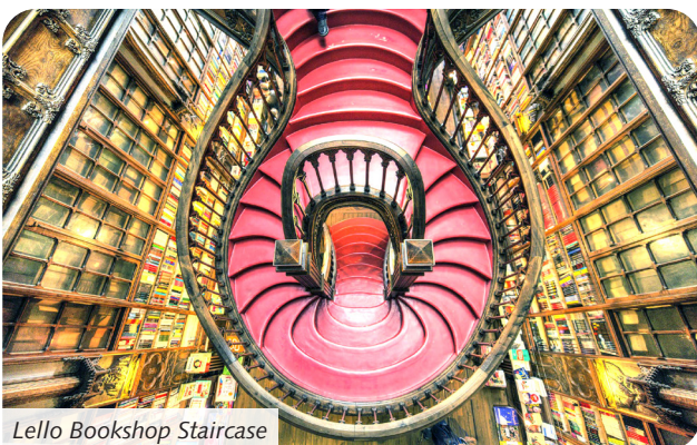
Lello Bookshop Staircase