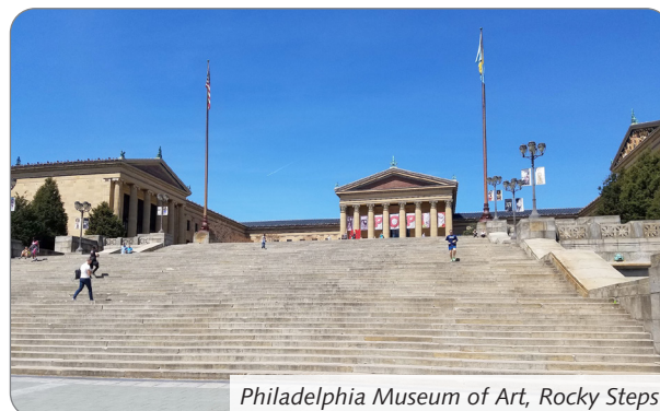
Philadelphia Museum of Art, Rocky Steps

Boxer Rocky Balboa's training run up the 72 steps of Philadelphia Art Museum is one of the iconic scenes from the 1976 film "Rocky". A statue of the champion at the base of the steps, made for "Rocky III" and installed in its present location in 2006, is one of the city's most iconic (and most photographed) landmarks of the city. The staircase itself dates to 1928, when the Art Museum building opened to the public.