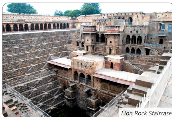
Lion Rock Staircase

Sigiria is an ancient rock fortress near Dambulla in Sri Lanka. It sits atop a rock nearly 200 metres high and is reached by climbing 1,200 steps. Halfway up the rock, on a small plateau two giant lion's paws mark the start of the final climb. Ancient frescoes adorn the rock walls and the view from the top is spectacular.