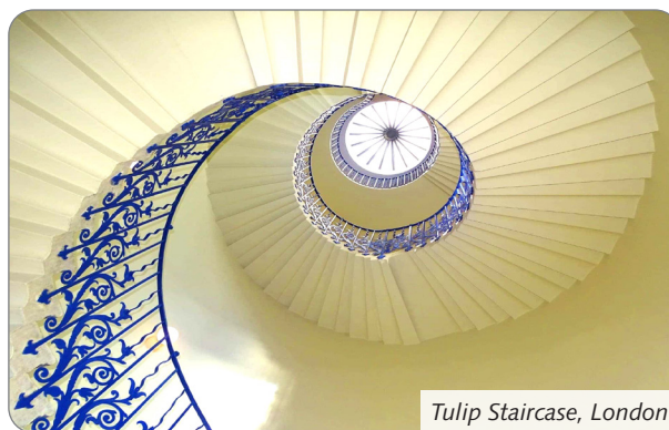
Tulip Staircase, London

This 17 th century architectural wonder – it is Britain's first self-supporting spiral staircase, meaning it lacks the usual load-bearing center column – is part of the Queen's House in Greenwich. It is also the site of one of the most famous paranormal events of the 20 th century. In 1966, a retired priest on vacation snapped a photo of the empty Tulip Staircase. The developed film revealed a spectral figure ascending the stairs, something that remains unexplained to this day.