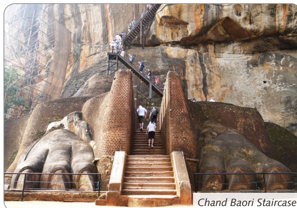
Chand Baori Staircase

Next to the Harshat Mata temple, this set of steps is one of India's oldest, with portions dating to the 8 th century. More than 3,500 steps zigzag up and down the 13-story structure, which descends about 100 feet below ground.