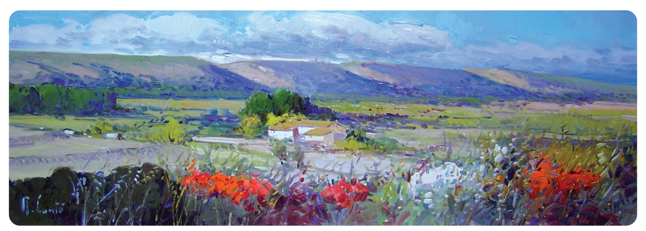
Rural landscape (oil on canvas. Artist: Rosa Campo, Spain).