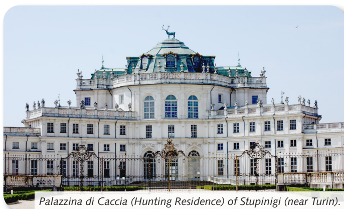
Palazzina di Caccia (Hunting Residence) of Stupinigi (near Turin).