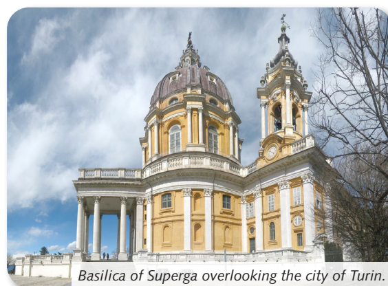
Basilica of Superga overlooking the city of Turin.