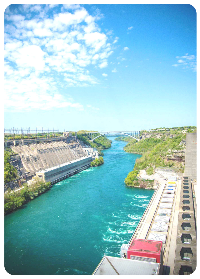
Sir Adam Beck Hydro Power Station (Niagara Falls)

The falling water, having served its purpose, exits the generating station to the tailrace where (it) rejoins the mainstream of the river to continue the cycle of creating clean renewable energy for Ontario.