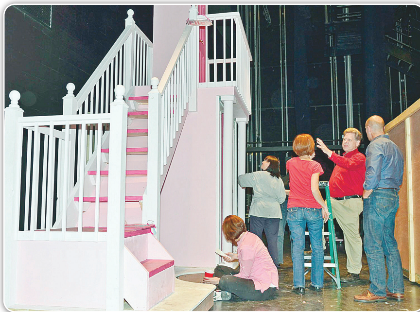
Set designers at work