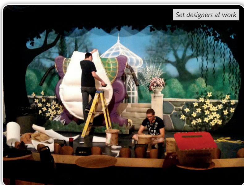
Set designers at work

All of the things appearing on the stage, different from the scenery, are called stage properties, or props. Set props like furniture, draperies and decorations are the types of things that complete the set and they need to be part of the set design. The set designer will normally read the script many times, both to get a feel for the flavour and spirit of the script and to list its specific requirements for scenery, furnishings and props. The time of day, location, season, historical period and any set changes required in the script are noted. The set designer's focus here is on understanding everything that may be needed based on the dialogue in the script.