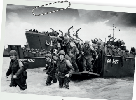
D-day, landing in Normandy

In 1945 the concentrations camps were liberated with the help of the Russian Army. Japan surrendered after the launch of the atomic bombs on Hiroshima and Nagasaki, and Germany soon after.