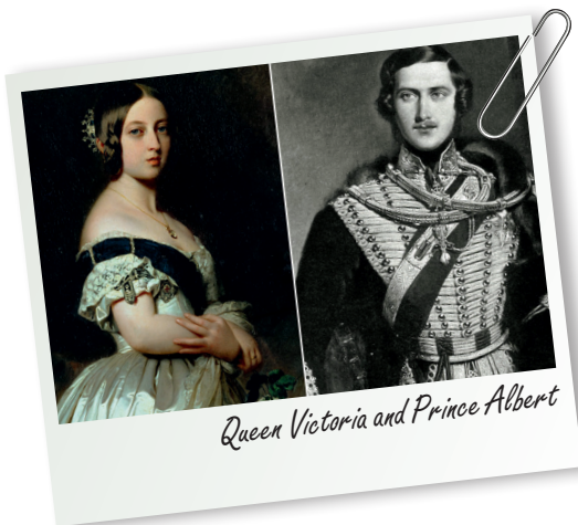
Queen Victoria and Prince Albert

Victoria died in 1901 after she had set the example of a hard-working monarchy and head of state above party politics.