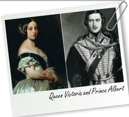
Queen Victoria and Prince Albert