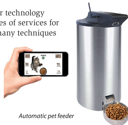
Automatic pet feeder