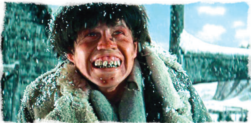
Koukol, the hunchback

“I don’t like living here,” she says to Alfred. “I get so bored, I don’t know what to do. I can’t do anything because my father always keeps me here in the inn. And my room is full of garlic!”