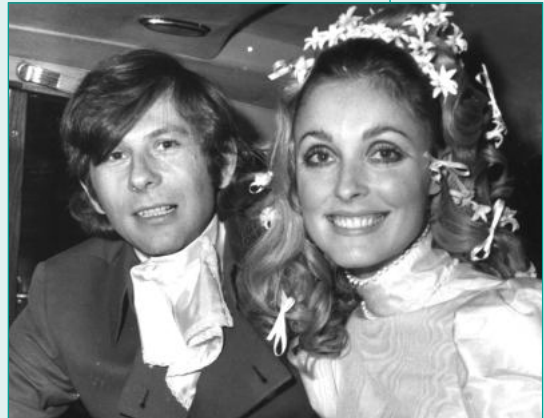
Roman Polański and Sharon Tate in 1968.

When he is six years old, he goes to primary school for some weeks but the Nazis expel 5 him and all the Jewish children. He cannot go to school for the next six years. In those years, the Nazis take his father to Mauthausen and his mother to Auschwitz. Here she dies after some days. Polański goes away from the Krakow ghetto in 1943 and survives 6 with the help of some Polish Roman Catholics. After the war, he meets his father again and they go back to Krakow. In 1968, he goes to the USA. He also spends some time and works in Europe, in Paris. One year after, a terrible event 7 happens in Polański's life: some members of the Manson Family, a group of criminals 8 , kill his pregnant 9 wife, the actress Sharon Tate, and four friends.